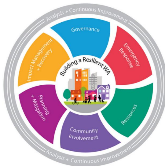
Figure 3.1: WA emergency management capability framework

figure 3.1) and identifies strengths and gaps affecting the sector. These findings are published in the annual state emergency preparedness report. However, there was no evidence of quality assurance of the survey results.