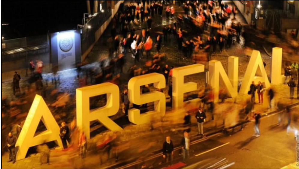
Figure 2.2: Sculpture as vehicle security barriers