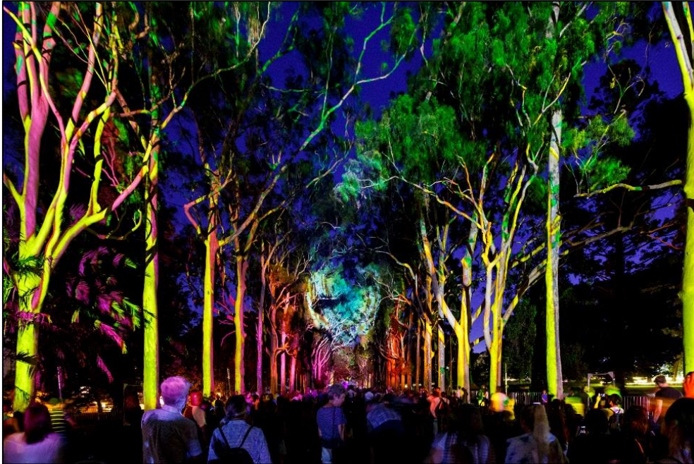
Figure 2.1: 'Boorna Waanginy: The Trees Speak' at Kings Park