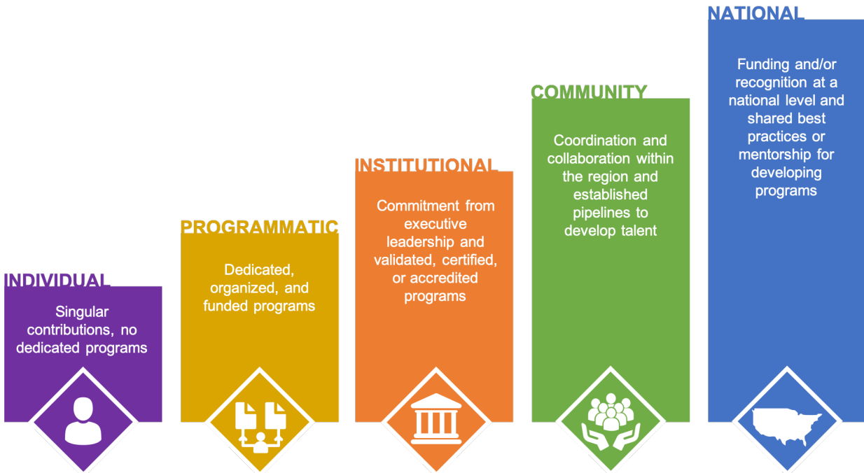
Figure 2 - RAMPS Maturity Model