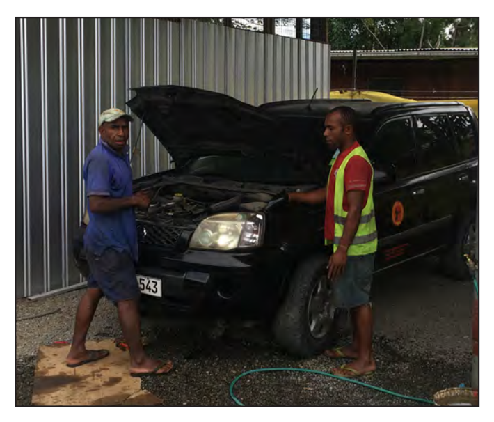
Mechanics in Lae: Large security companies employ their own mechanics and other technicians.

Most companies provide static guards, which make up the bulk of the workforce. Companies provide static asset protection to extractive projects, agricultural plantations, government offices, shopping centres, airports, hospitals, schools, banks, embassies and private residences. They also provide other services, such as close personal protection; escorting mobile assets; security training; security assessments; emergency evacuations; rapid response capabilities; satelllite tracking; and the supply, installation and monitoring of electronic surveillance systems.