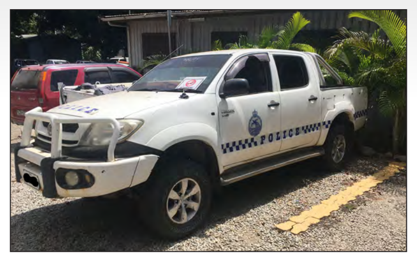
A private security company repaired a police vehicle.

As we have noted, relationships between the police and private security operators do not inevitably lead to improved security outcomes (paying police to ensure a shooting incident does not go to court clearly undermines the justice system). Indeed, we do not argue that the private security industry inevitably improves security, particularly for those parts of the population that cannot afford these services. However, it is important to note that private security operators are involved in many of the same kinds of policing activities as their uniformed colleagues, including