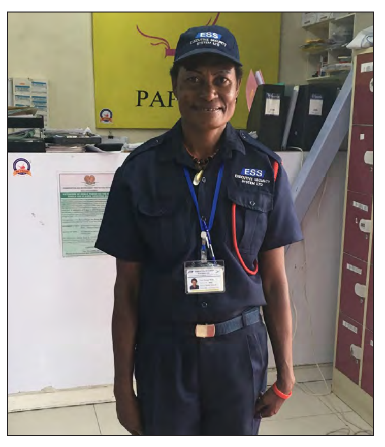
Female security guard: though rarer than their male counterparts, female guards can still be spotted around urban centres.

Some people we interviewed were concerned about the potential for violence against women who work in the security sector. One security company owner suggested that the threat of